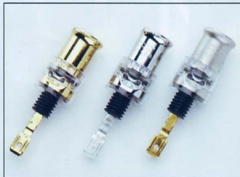
3 The WBT-0710 is available in 3 different versions: two with gold-plated copper-conductors and one with a silver conductor