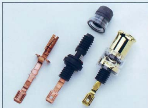
1 The explosion drawing shows the design of the nextgen terminals: pure copper and dual protection

ductor. Both materials may be perfect conductors, but they are far too soft to withstand the strains on a binding post. This is why the 0710s are protected against deformation by a sturdy plastic sheath. Figure 1 shows the design of the copper version, which is gold-plated to prevent oxidisation.